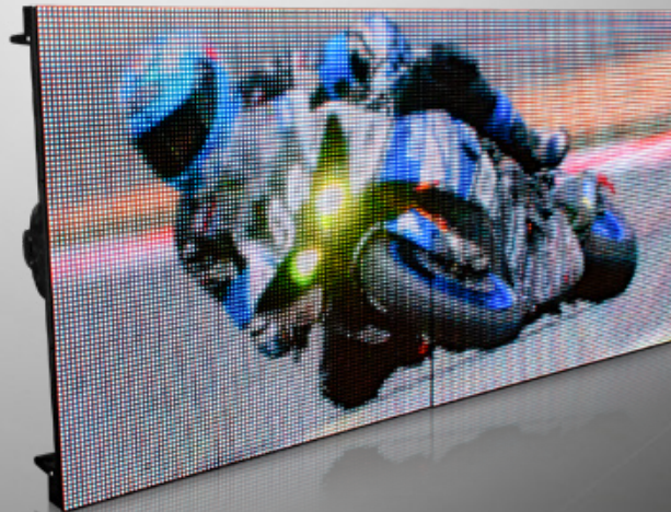
2 Pack ITSVLDP6-2 displays

Make your creation easier thanks to the predefined content in the drop-down menu ➡➡